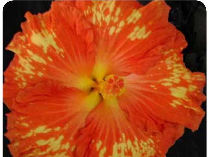
The Professor Chris O'Brien hibiscus, a spectacular vibrant orange bloom with golden yellow splotches during summer. The bloom is approximately 20cm once the bush is established.

THREE new signature varieties of hibiscus have been developed by the Hibiscus Society of Queensland to help raise funds for The Chris O'Brien Lifehouse at RPA in Sydney.